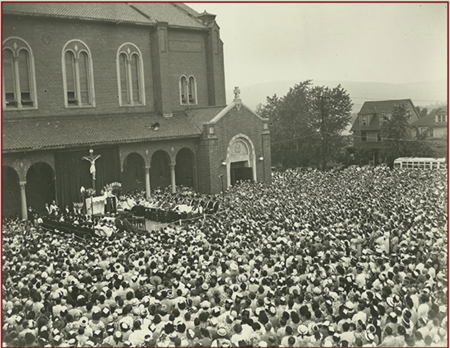
CELEBRATION OF ST. ANNE IN SCRANTON, PA