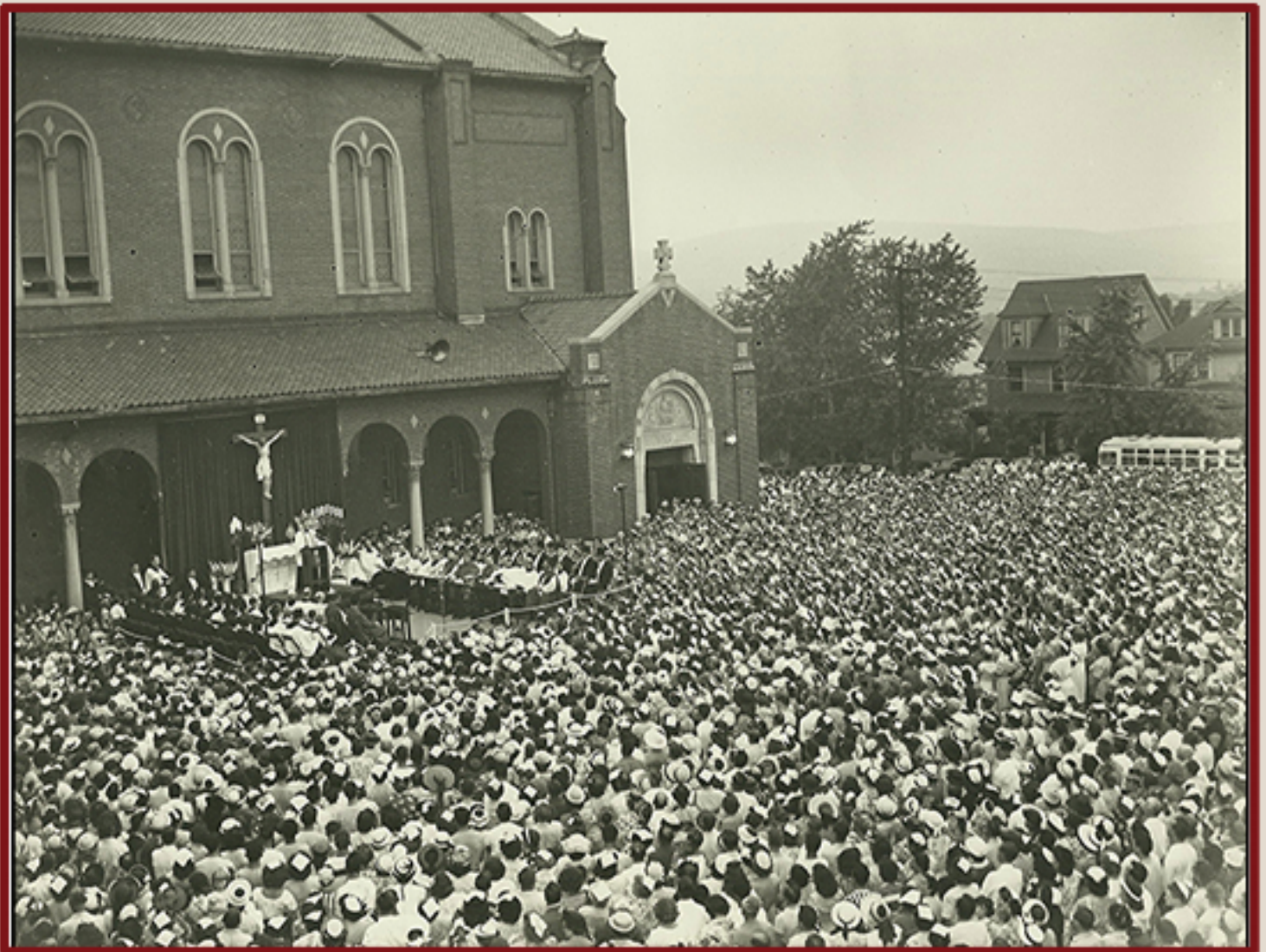
St. Ann's Monastery and Shrine Basilica in Scranton, PA on July 18th