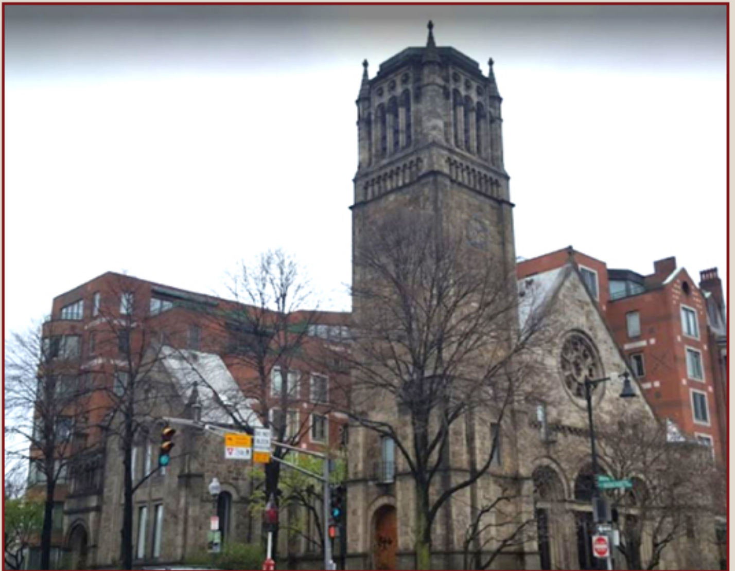
St. Cecilia's Church in Boston, MA