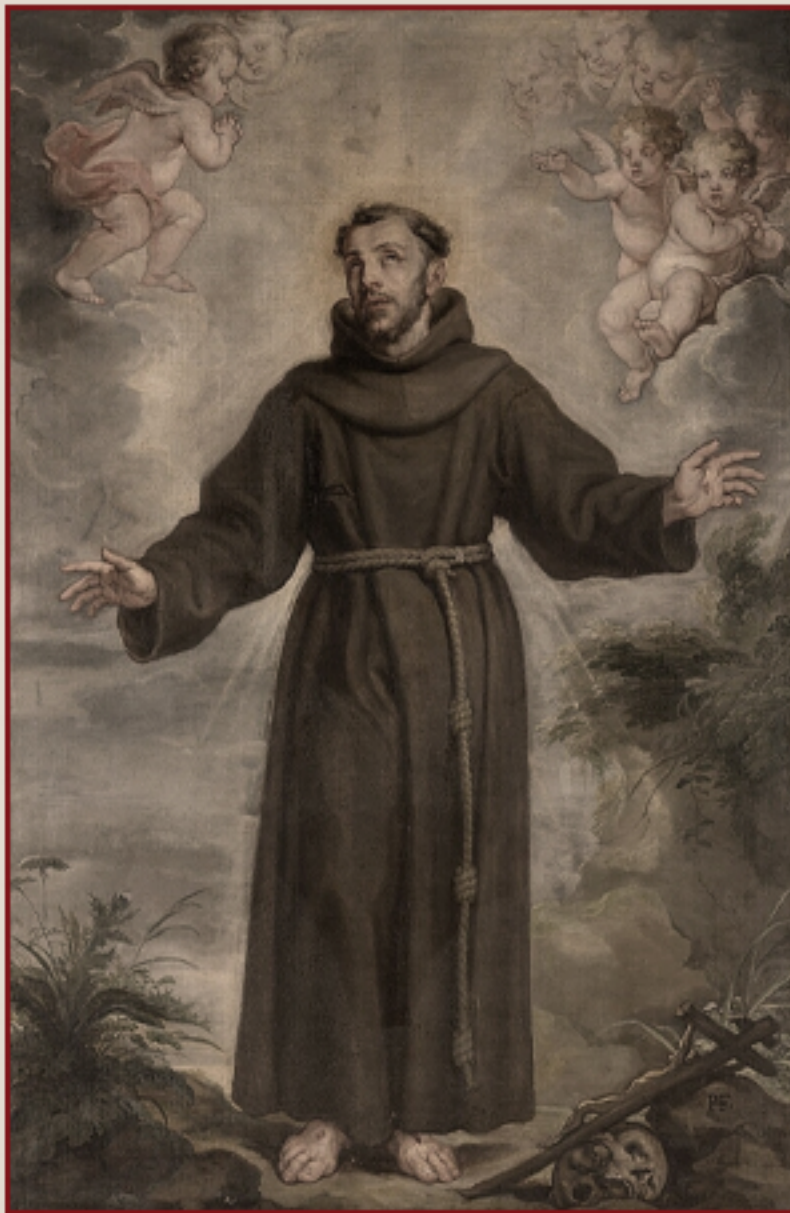
St. Francis of Assisi