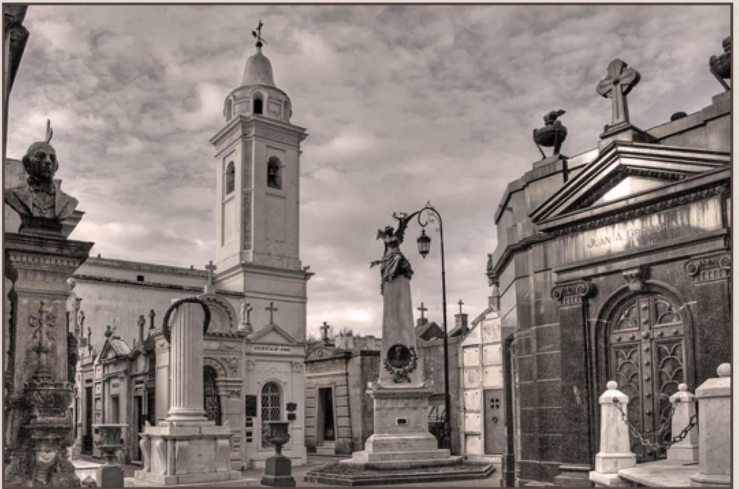
La Recoleta in Buenos Aires